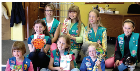
Members of Anacortes Girl Scout Troop 52101 deliver dog supplies to Summit.

Yellow Labrador banks are popping up in Granges around the state of Washington under an initiative sponsored by members of Washington State Junior Grange. Junior Grange members visit Granges in their areas, present information about Summit and leave behind the banks they have created for fundraising purposes. Their goal is to raise $2,500 by June 2014, when they hold their annual conference.