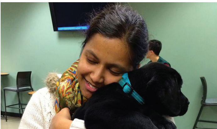
Summit pup Oscar is up for the task!

More than 200 Edmonds Community College students have visited Summit puppies and dogs during Doggy De-Stress Days at the college. Summit has gathered up the pack twice and headed to the college right before finals weeks, and we’re looking forward to continuing this mutually beneficial relationship. Based on the comments we heard from students, we achieved our goal of helping make things a little better in what can be a tough week.