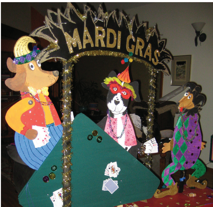
Summit-Kitsap float wins $3,000 grand prize!