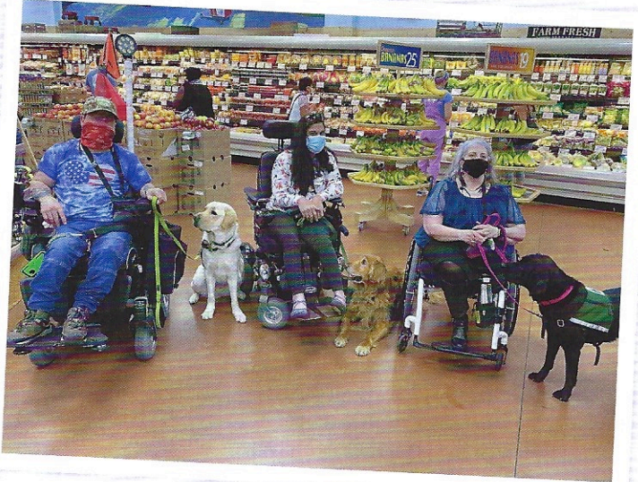
Team training group outing to learn how to work as a service dog team in public