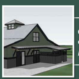
Canine Condo construction begins Page 4