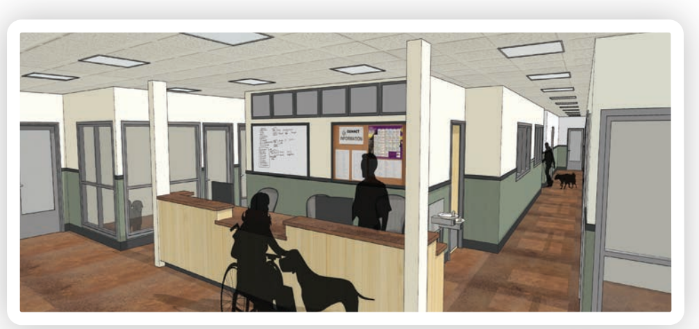
CANINE CONDO INTERIOR

We anticipate a busy year in 2021 as we complete the Canine Condo and elevate our fundraising campaign to the next level to complete the entire campus, which will enable us to change the lives of many more people through a partnership with a skilled service dog. Visit summitdogs. org/capitalcampaign to learn more about the Unleashing Potential Capital Campaign and our plans for the future.