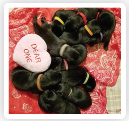
The K litter (11 puppies) was born to Stitches on February 9, 2020

In 2020, Summit welcomed four litters of Labrador puppies. From birth to eight weeks old, the puppies and their moms were cared for by dedicated staff and volunteers. All of the puppies have begun their service dog training journey with our trainers, volunteer foster homes, and partner programs. We look forward to seeing how these pups progress throughout 2021!