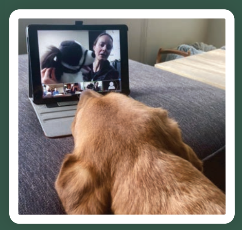
HUMMEL SKIPPING THE MIDDLE MAN AND LEARNING DIRECTLY DURING PUPPY RAISER CLASS