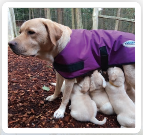
The N litter (8 puppies) was born to Maggie on November 15, 2020

In addition to multiple litters of adorable puppies, Summit is proud to share these 2020 accomplishments: