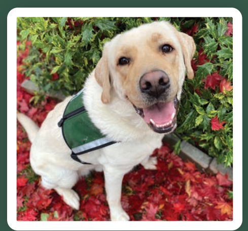
JAMON IN FALL COLORS

■ Our annual Unleash Your Love giving event runs this year from April 6 – May 6, 2021. Join us for a month of interactive virtual activities culminating with a moving finale program on Thursday, May 6, 2021. Interested in playing a key role in creating life-changing service dog partnerships via Unleash Your Love? Visit summitdogs. org/unleashyourlove for more information.